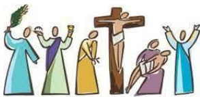
Stations of the Cross

Stations of the Cross will begin on Wednesday February 25 th at 5:30pm in the Church. Our Soup Suppers will be served, immediately following, in the Parish Hall.